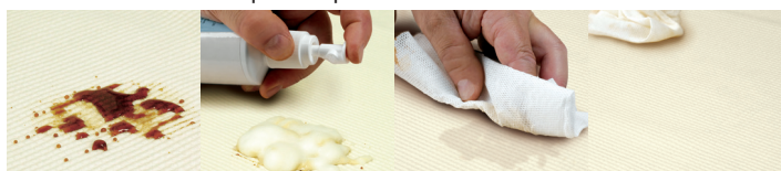
Soy sauce is easily removed.

Halo's inherent stain resistance allows easy removal of most stains from non-liquid repellent treated fabric.