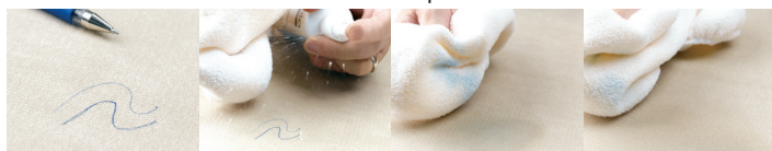
For oil based biro marks see opposite page, Oil-based stains.

The removal of water-based pen marks* is possible using detergent based spot cleaners. For textured fabrics, apply Halo Spot Cleaner to a clean cloth first, not directly to the fabric surface. This method will help prevent channeling of stains into the fabric textures or patterns.