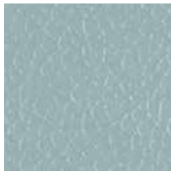
Lustrell Charisma Breeze