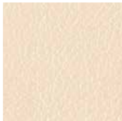
Lustrell Charisma Buff