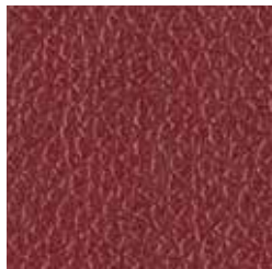
Lustrell Charisma Cabernet